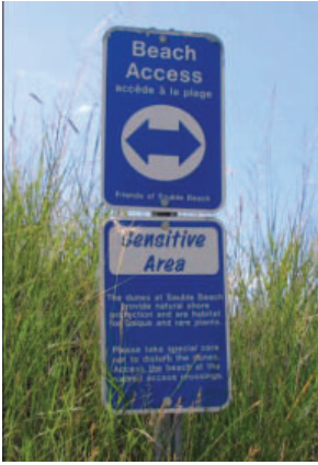
Provide interpretive signage.