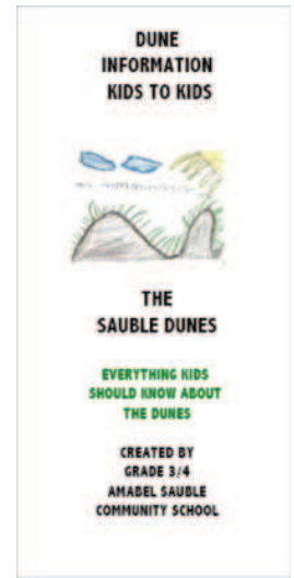
Develop, produce and distribute educational materials.