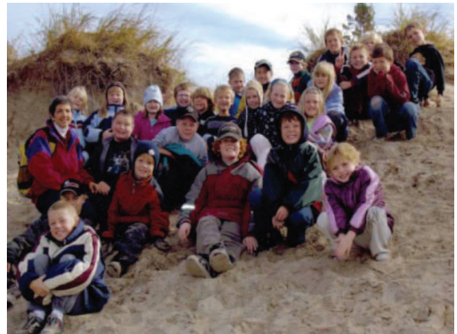
Involve school children in "Kids to Kids" program.