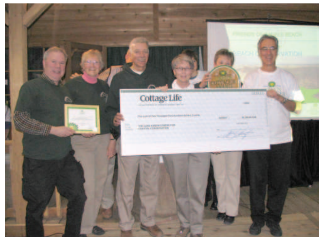
In 2007, the efforts of FSB was recognized by Cottage Life Magazine. FSB was awarded the first ever Green Cottager Group Award.