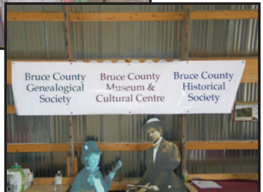
Friday, August 20 - Sunday, August 22 volunteers from the Bruce County Historical Society, Bruce County Genealogical Society and the staff from the Bruce County Museum & Cultural Centre manned a booth at the Heritage Steam Show near Paisley.