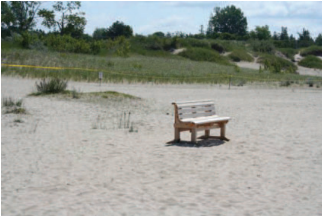
Provide benches on the beach.