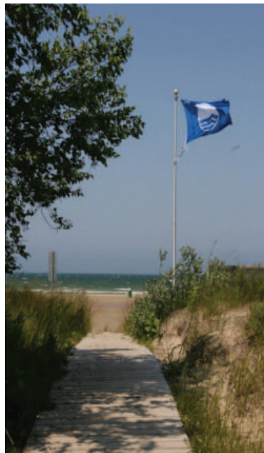
Instrumental in Sauble Beach becoming the 1 st Beach on Lake Huron and the 2 nd Beach in North America to fly the Blue Flag.